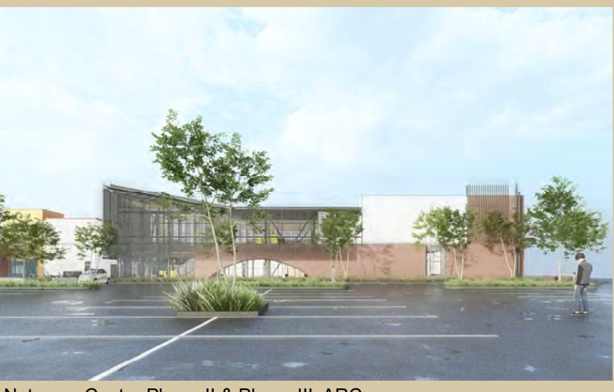
Natomas Center Phase II & Phase III, ARC

American River College Cosumnes River College Folsom Lake College Sacramento City College