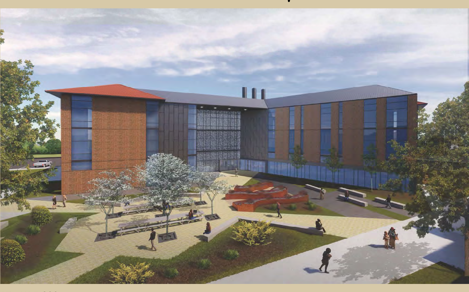
Lillard Hall, SCC

Los Rios Community College District 2021-22 Annual Report